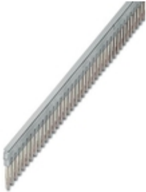
Plug-in bridge, pitch: 5.2 mm, number of positions: 50, color: gray

Please be informed that the data shown in this PDF Document is generated from our Online Catalog. Please find the complete data in the user's documentation. Our General Terms of Use for Downloads are valid ( http://phoenixcontact.com/download )